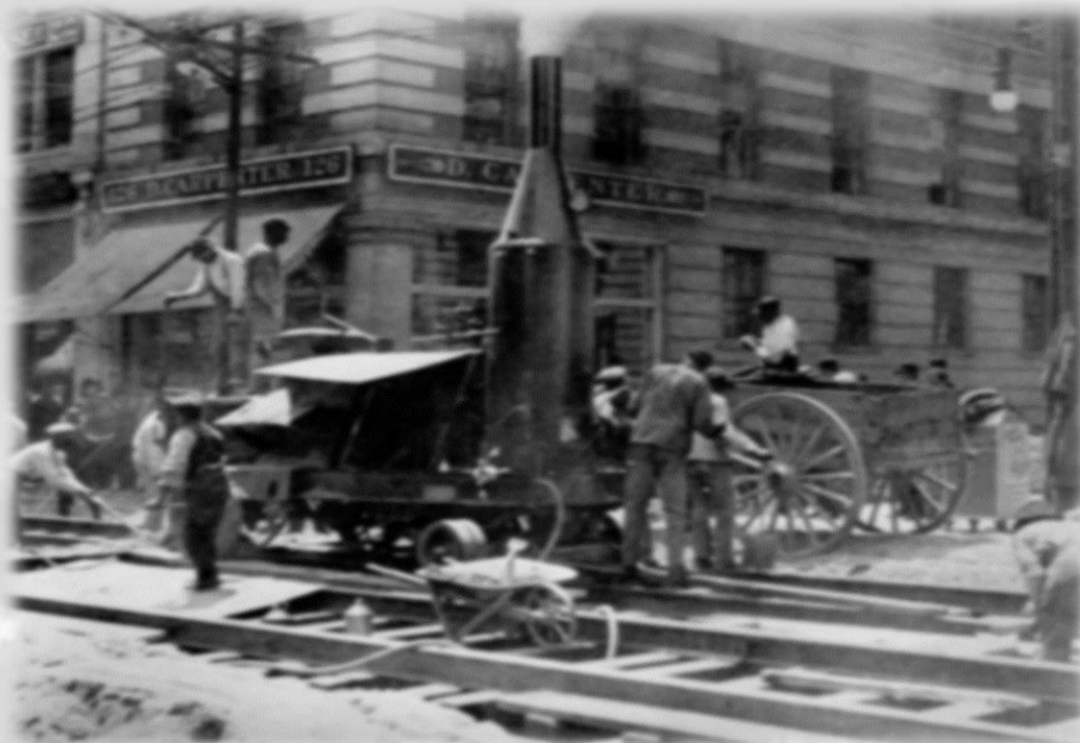
The Brick circa 1940

TRADITIONAL MIMOSA OR SANGRIA 4- Glass | 11- Pitcher